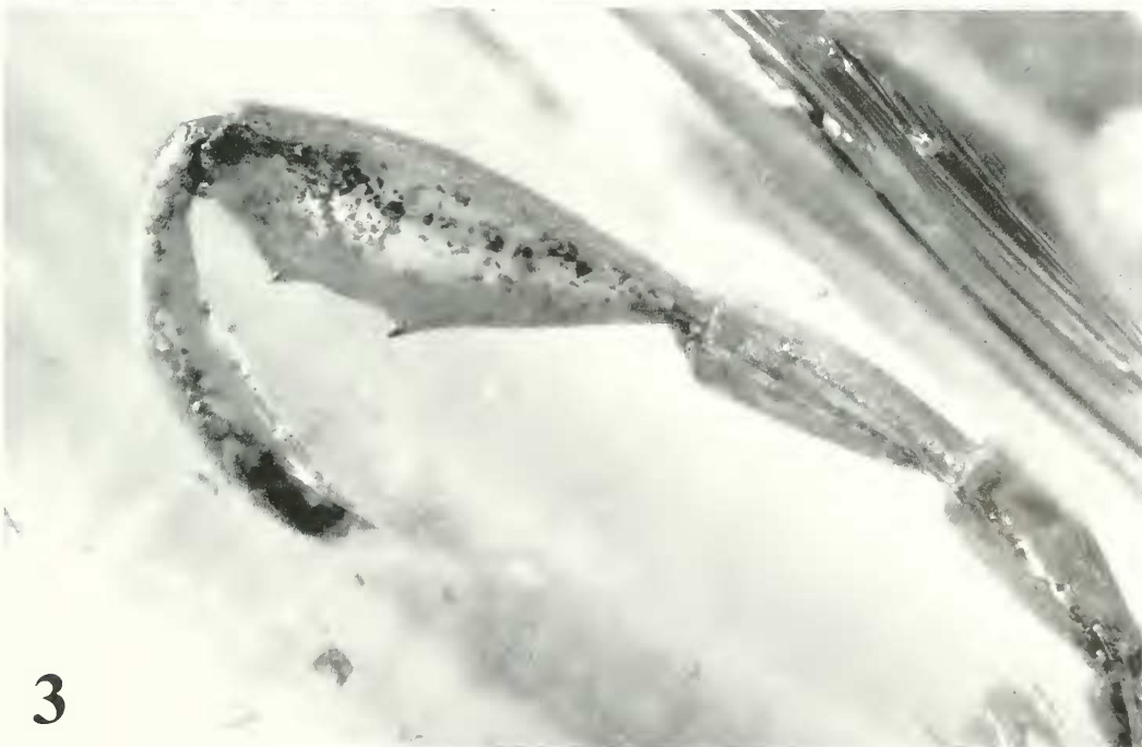
Figs. 2-3. Photomicrographs of Pelecinopteron tubuliforme Brues (AMNH). 2. Lateral view of mesosoma and head. 3. Lateral view of distal metasomal segments (from left to right = segments 7, 6, 5, 4, and apex of 3).